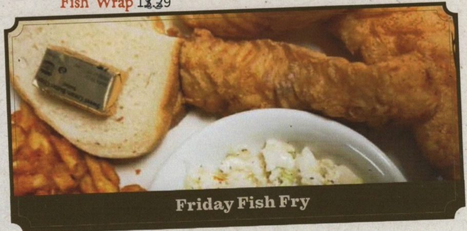
Friday Fish Fry