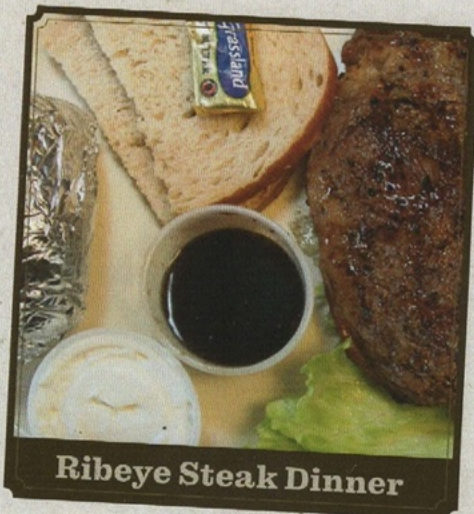
Ribeye Steak Dinner