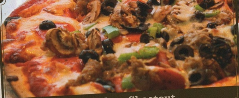
The Saloon Shootout

Sausage • Pepperoni • Canadian Bacon Mushrooms • Tomatoes • Green Peppers Onions • Black Olives • Green Olives Pineapple • Jalapeno • Extra Cheese