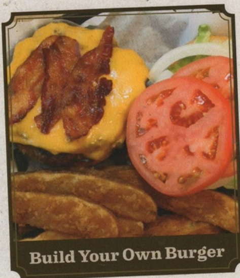
Build Your Own Burger