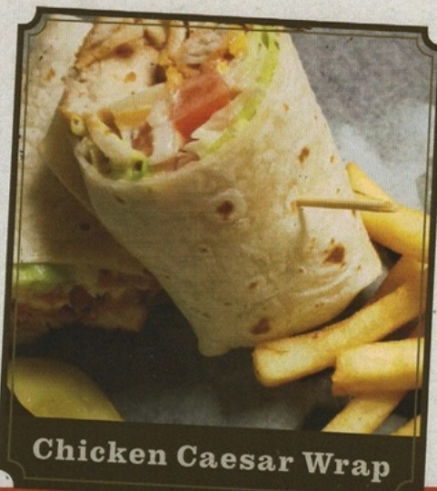
Chicken Caesar Wrap

6 oz. Sirloin chargrilled to perfection, served on a hoagie roll. 16.49