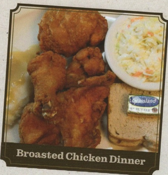
Broasted Chicken Dinner