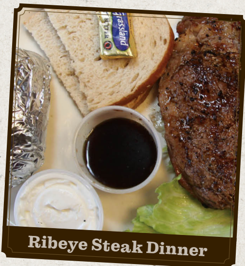
Ribeye Steak Dinner