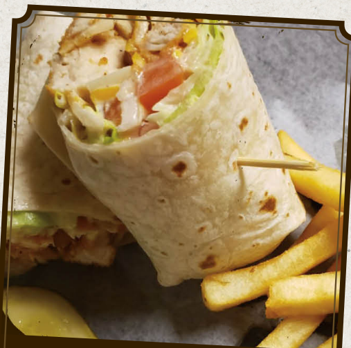
Chicken Caesar Wrap

6 oz. Sirloin chargrilled to perfection, served on a hoagie roll. 16.49