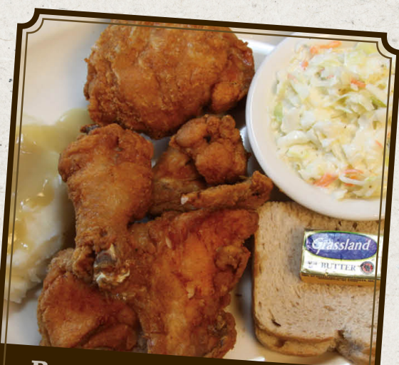
Broasted Chicken Dinner

Note: Any substitutions for Broasted Chicken dinners will change the price to by the piece pricing.