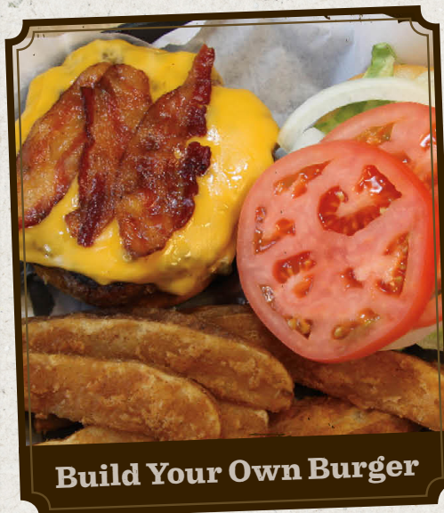
Build Your Own Burger