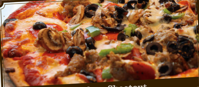
The Saloon Shootout

Sausage • Pepperoni • Canadian Bacon Mushrooms • Tomatoes • Green Peppers Onions • Black Olives • Green Olives Pineapple • Jalapeno • Extra Cheese