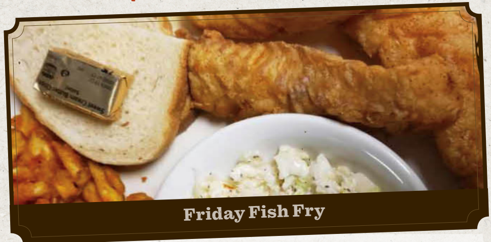
Friday Fish Fry

4 piece chicken dinner with choice of potato, coleslaw and bread. 11.99