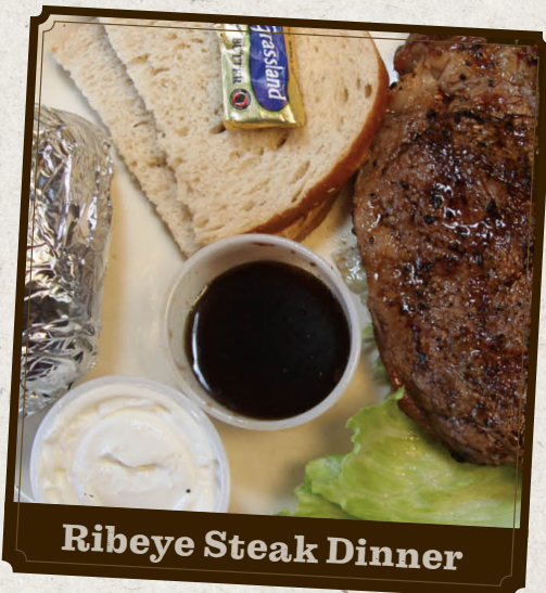
Ribeye Steak Dinner