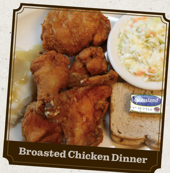
Broasted Chicken Dinner

Note: Any substitutions for Broasted Chicken dinners will change the price to by the piece pricing.