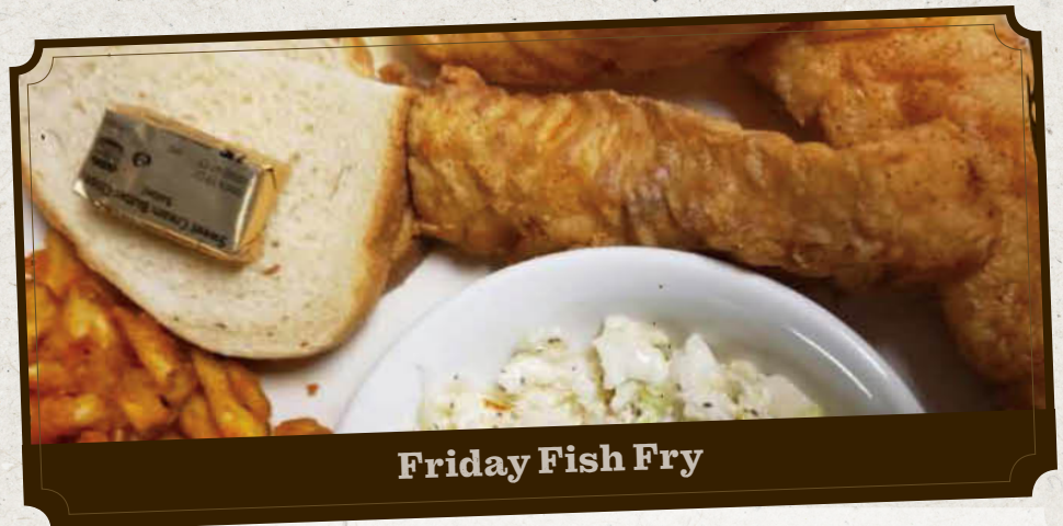
Friday Fish Fry

4 piece chicken dinner with choice of potato, coleslaw and bread. 11.99