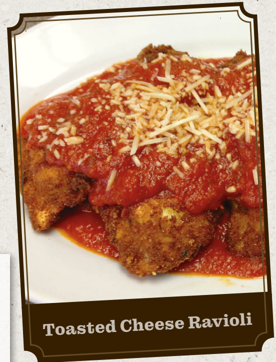
Toasted Cheese Ravioli

Served with Marinara and grated parmesan 7.99