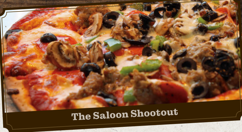
The Saloon Shootout

Sausage • Pepperoni • Canadian Bacon Mushrooms • Tomatoes • Green Peppers Onions • Black Olives • Green Olives Pineapple • Jalapeno • Extra Cheese